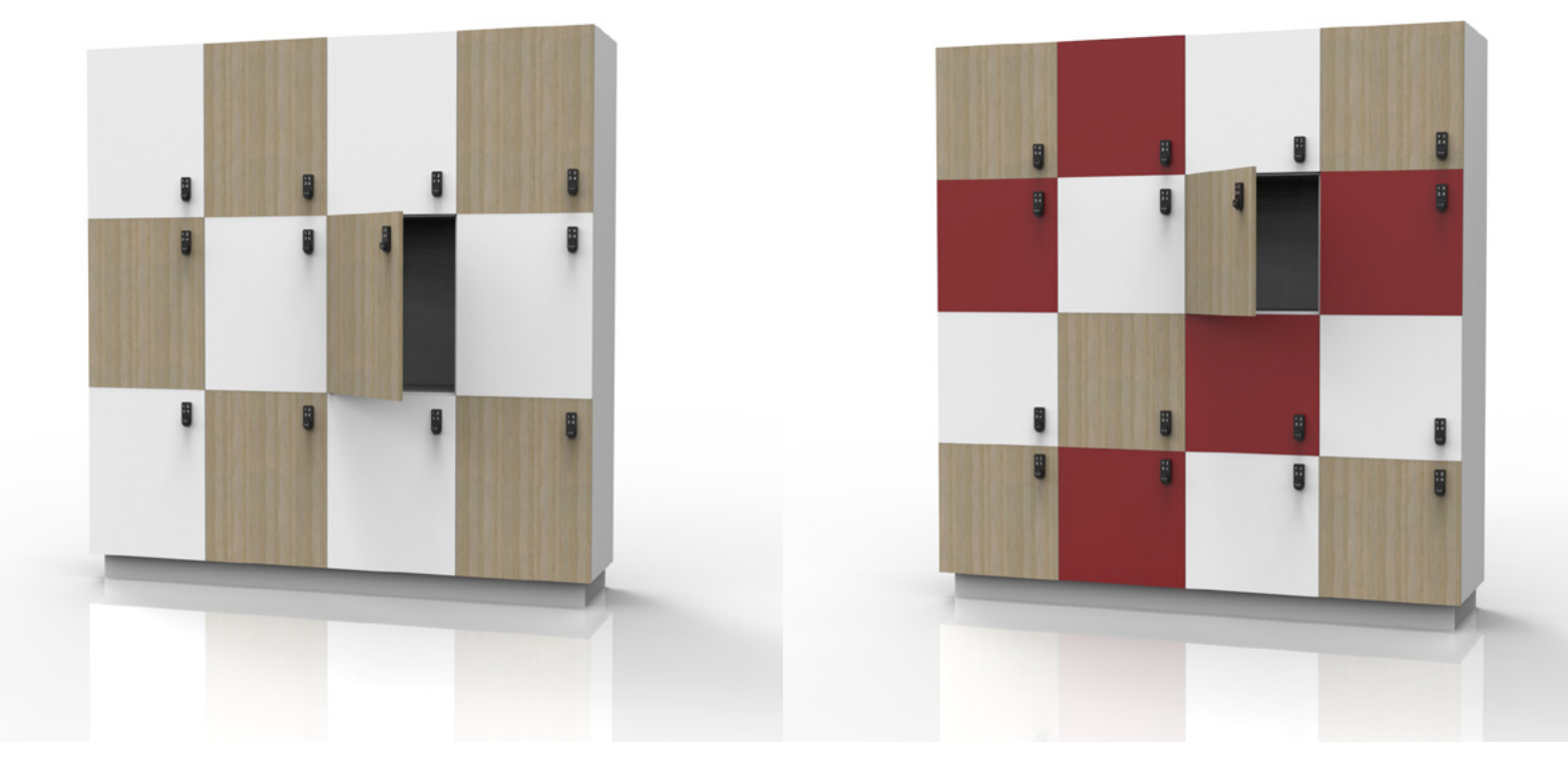
Type C Type D