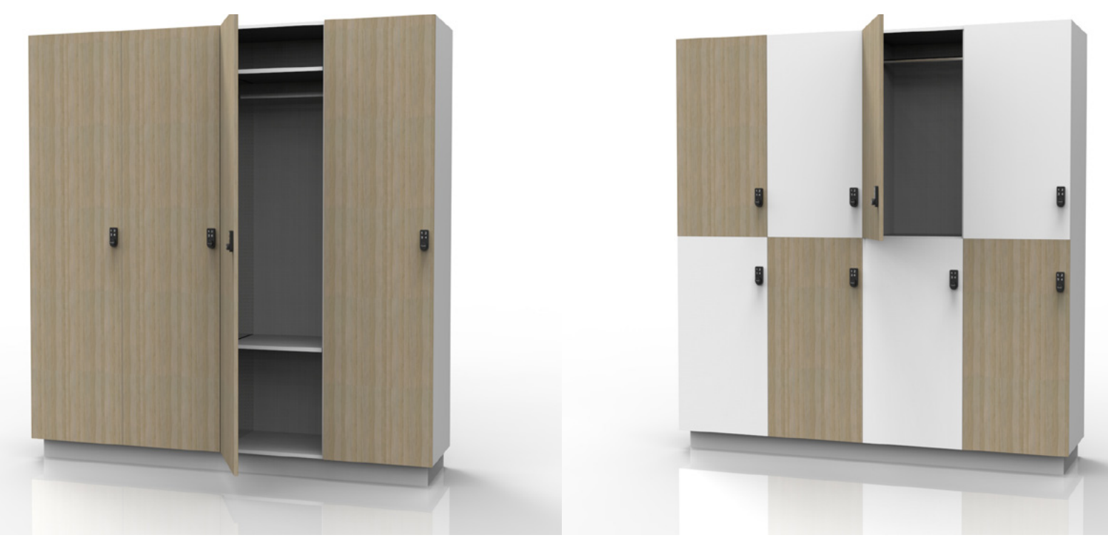
Type A Type B