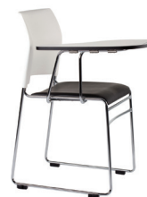
Maxim with Tablet (Indent only)