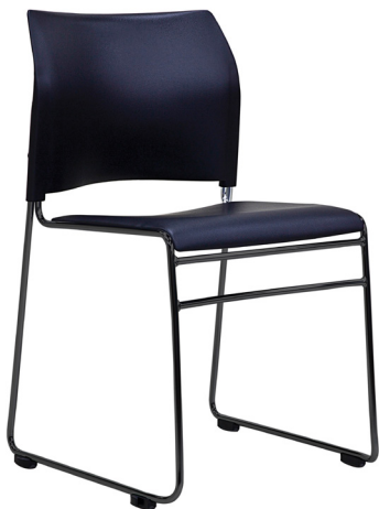
Maxim with Powder Coated frame (Indent only)