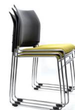
Stacked, featured in custom upholstered seat