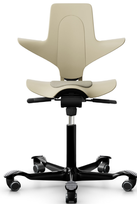
Design: Peter Opsvik. Patent- and design protected.