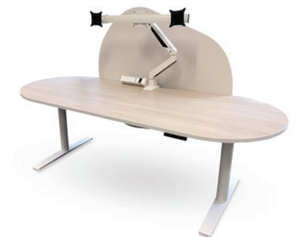
FREESTANDING RONDO WITH FEET & ECLIPSE SHAPE SCREEN