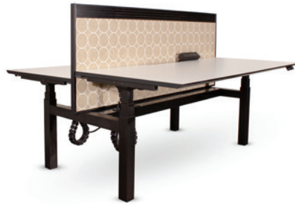
35MM STATIC SCREEN FIXED TO BRIDGE