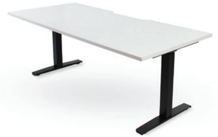
FREESTANDING FLIGHT WITH FEET