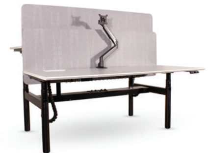
STRAIGHT ECLIPSE SCREENS (INDIVIDUAL PER WORKPOINT)