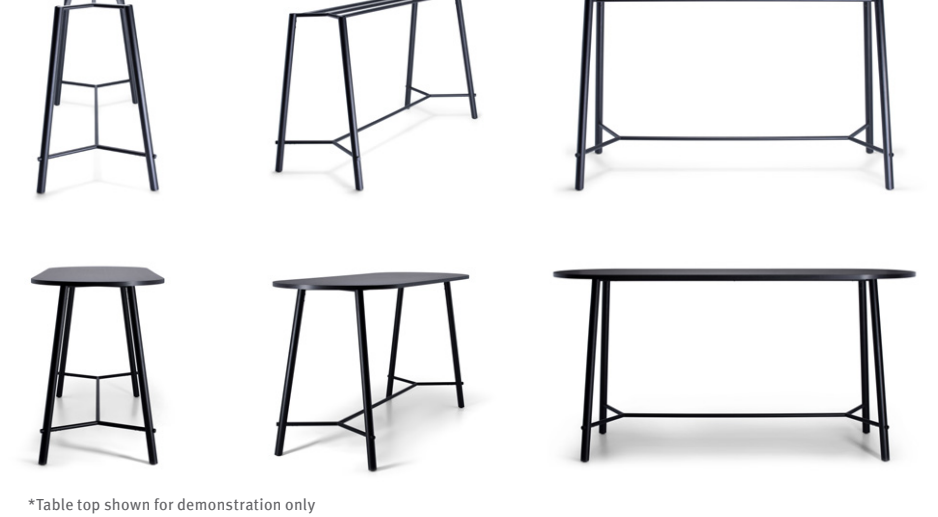
TABLE TOP OPTIONS