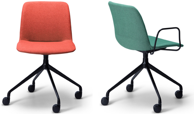
4 Way Swivel