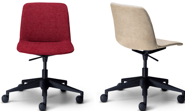
5 Way Swivel