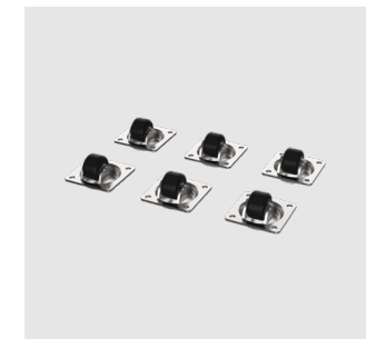
MOVABILITY KIT allows you to easily relocate your Framery O without disassembly. This kit includes six castors to make it easier to move the pod.