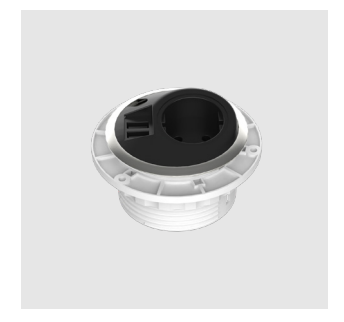
POWER OPTIONS includes outlets with or without two charging USB-C+A sockets and a LAN cable lead-through.