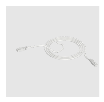
LAN CABLE 7 m.