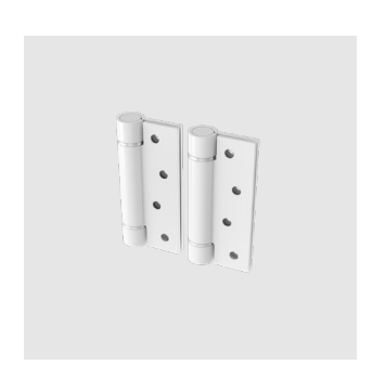
SELF-CLOSING HINGES can be used to limit the opening of doors and to make sure that they are not blocking passageways. Available in black and