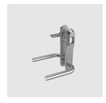
SMART LOCK COMPATIBLE is a kit of parts that allows selected smart locks and key locks to be installed in Framery O.