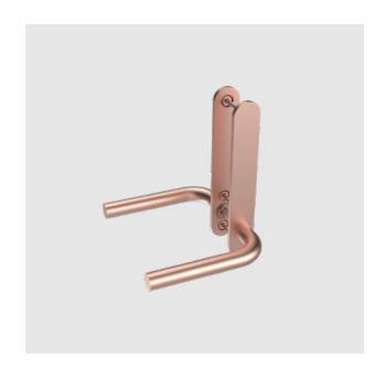
COPPER-PLATED DOOR HANDLE helps to prevent the spread of viruses. According to a study by Centers for Disease Control and Prevention (CDC), viruses disintegrates quicker after landing on copper surfaces than on plastic or stainless steel surfaces.