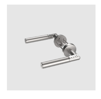
ELECTROMECHANICAL CODE LOCK handle can be used to limit access to a pod only for users with a number code.