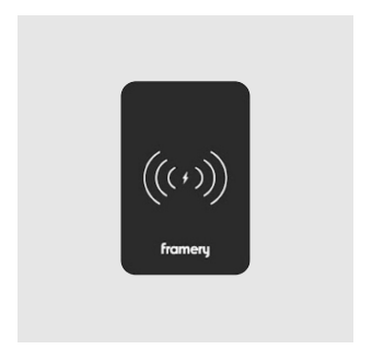
WIRELESS CHARGER allows you to charge your phone fast and wire-free inside our pods. The charger itself is located underneath the table, with a sticker on top of the table indicating where to place your phone to charge. Available for Wide table.