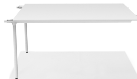
Phoenix, table 1400 Extension Dimensions: W 1400, D 1100, H 720 Tabletop in white laminate as standard* Frame: Aluminium Legs: Steel**