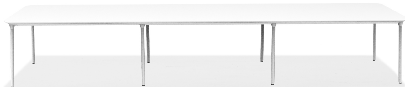
Phoenix, table 4300 Dimensions: W 4300, D 1100, H 720/900 Tabletop in white laminate as standard* Frame: Aluminium Legs: Steel**