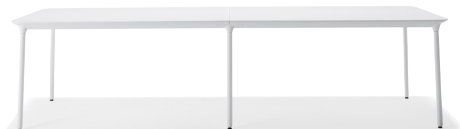
Phoenix, table 2900 Dimensions: W 2900, D 1100 H 720/900 Tabletop in white laminate as standard* Frame: Aluminium Legs: Steel**