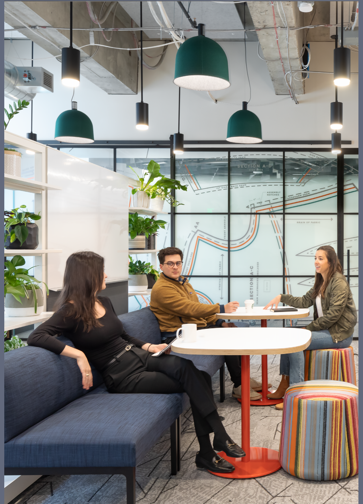
The "Tailor Shop" – Seattle, USA | SABA Architects