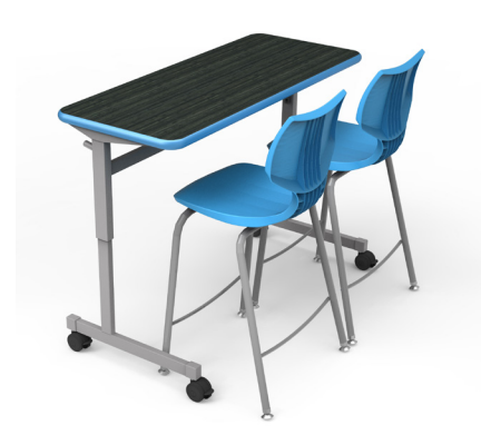
Model # Shown: 01676