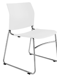
CS One White, Sled