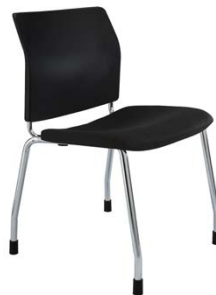
CS One Black, 4 Leg