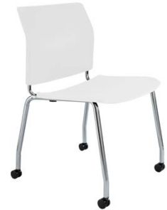
CS One White, 4 Leg with castors