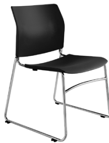
CS One Black, Sled