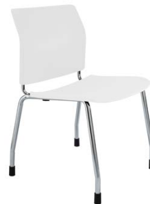
CS One White, 4 Leg