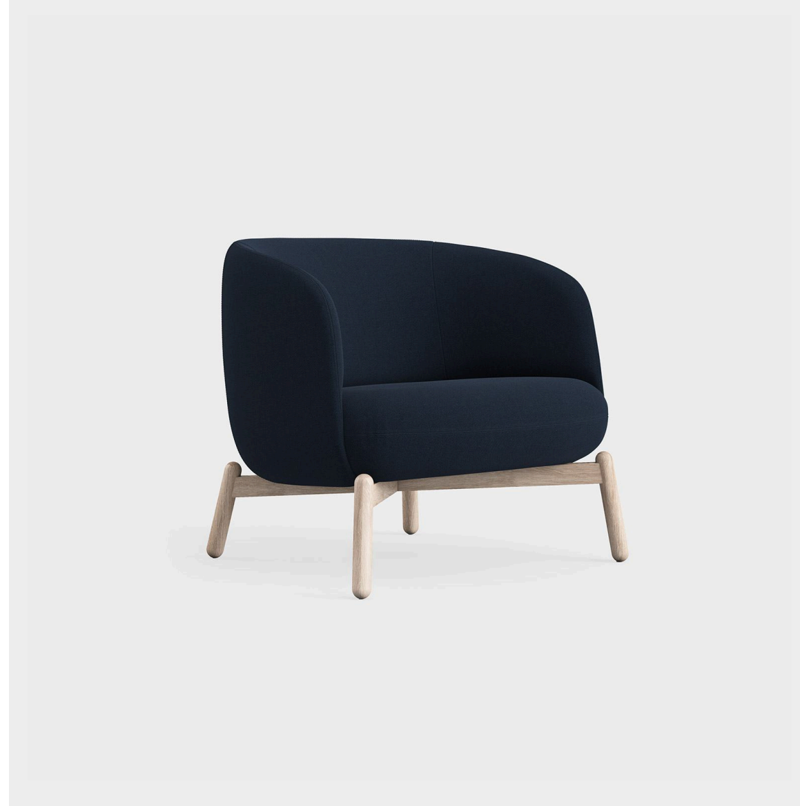
NEST Club Chair Oak

Height: 770mm Depth: 850mm Width: 870mm Seat Height: 450mm