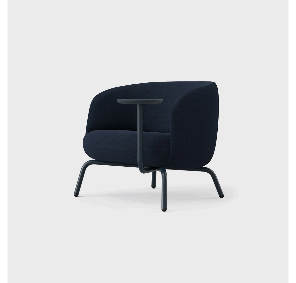
NEST Club Chair w. Table right

Height: 770mm Depth: 1100mm Width: 890mm Seat Height: 450mm