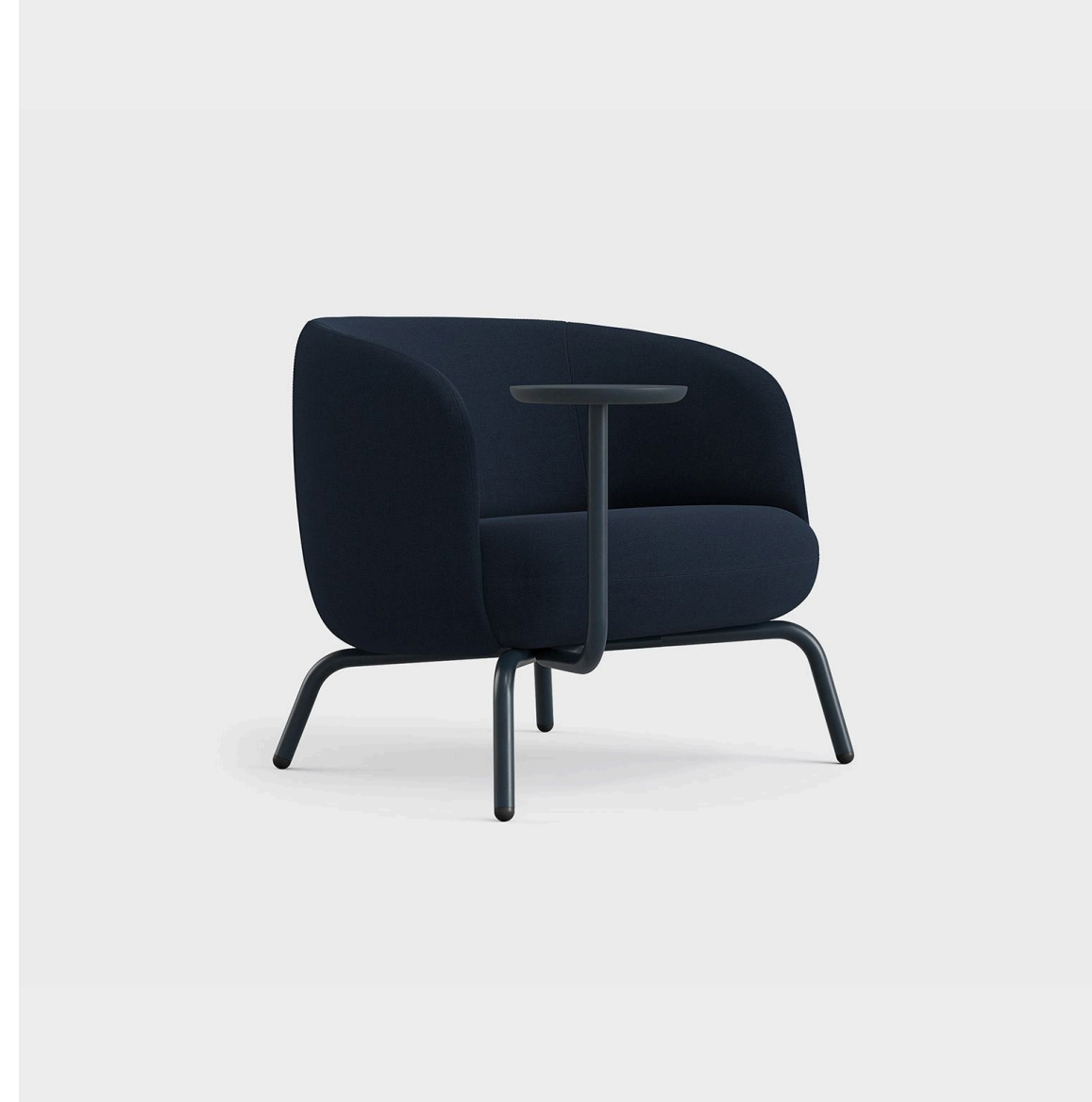
NEST Club Chair w. Table left

Height: 770mm Depth: 850mm Width: 870mm Seat Height: 450mm