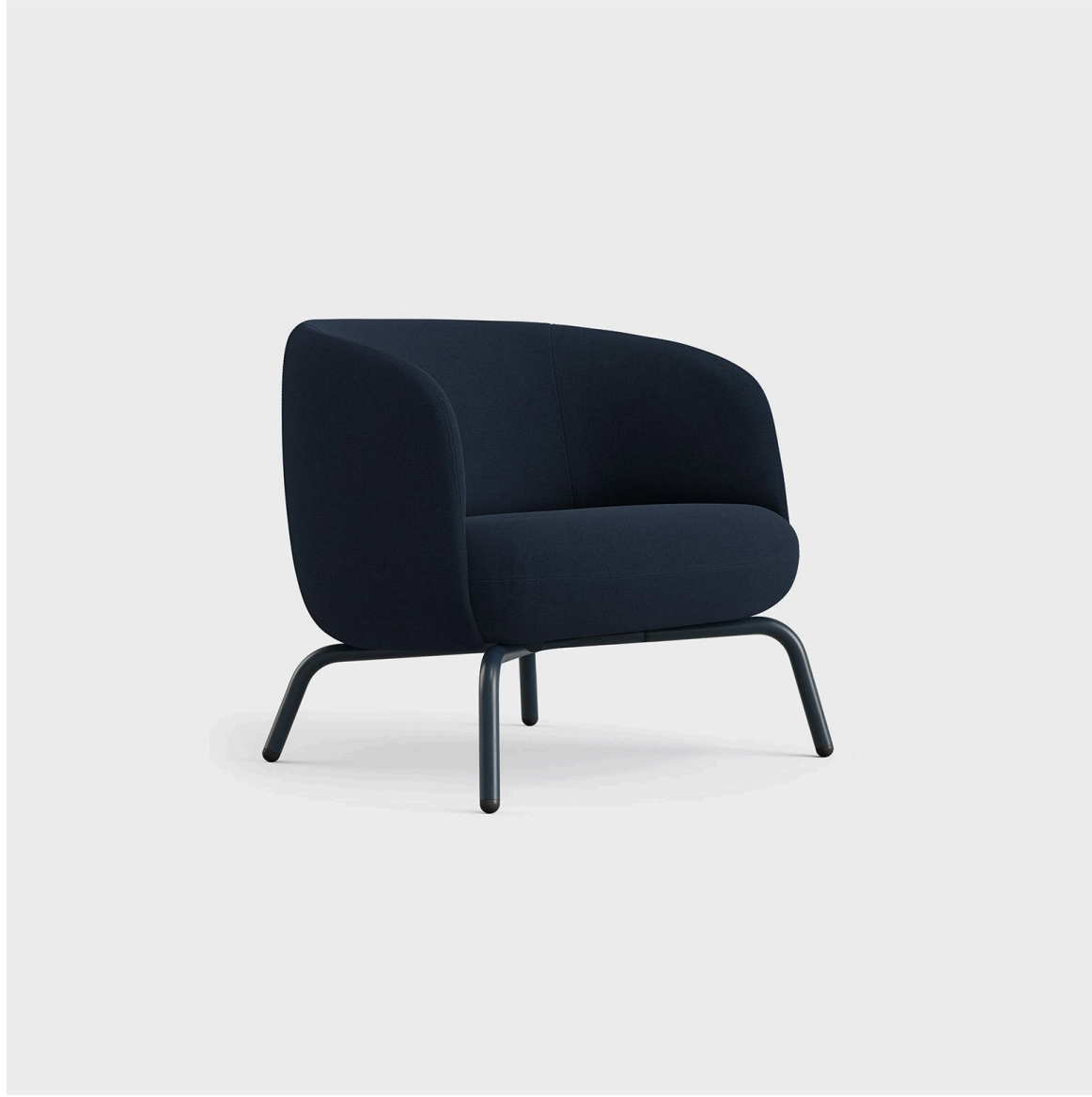
NEST Club Chair

Height: 770mm Depth: 850mm Width: 870mm Seat Height: 450mm